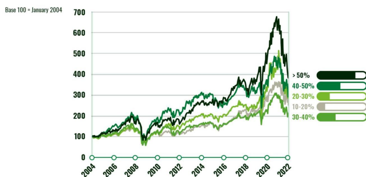
The stock performance according to the share of the company held by the same family

Looking again at the period from January 2004 to October 2022, the stocks of businesses that are more than 50%-owned by the founding family post much higher gains than companies with lower family stakes. This is largely due to better alignment between the interests of shareholders and management. Such majority-owned businesses are also less subject to the demands of minority shareholders whose interests may not be consistent with those of management and/or the company's long-term goals.